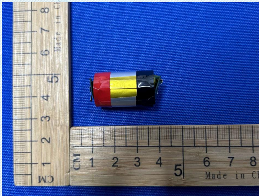
Figure 4 Back view of cell