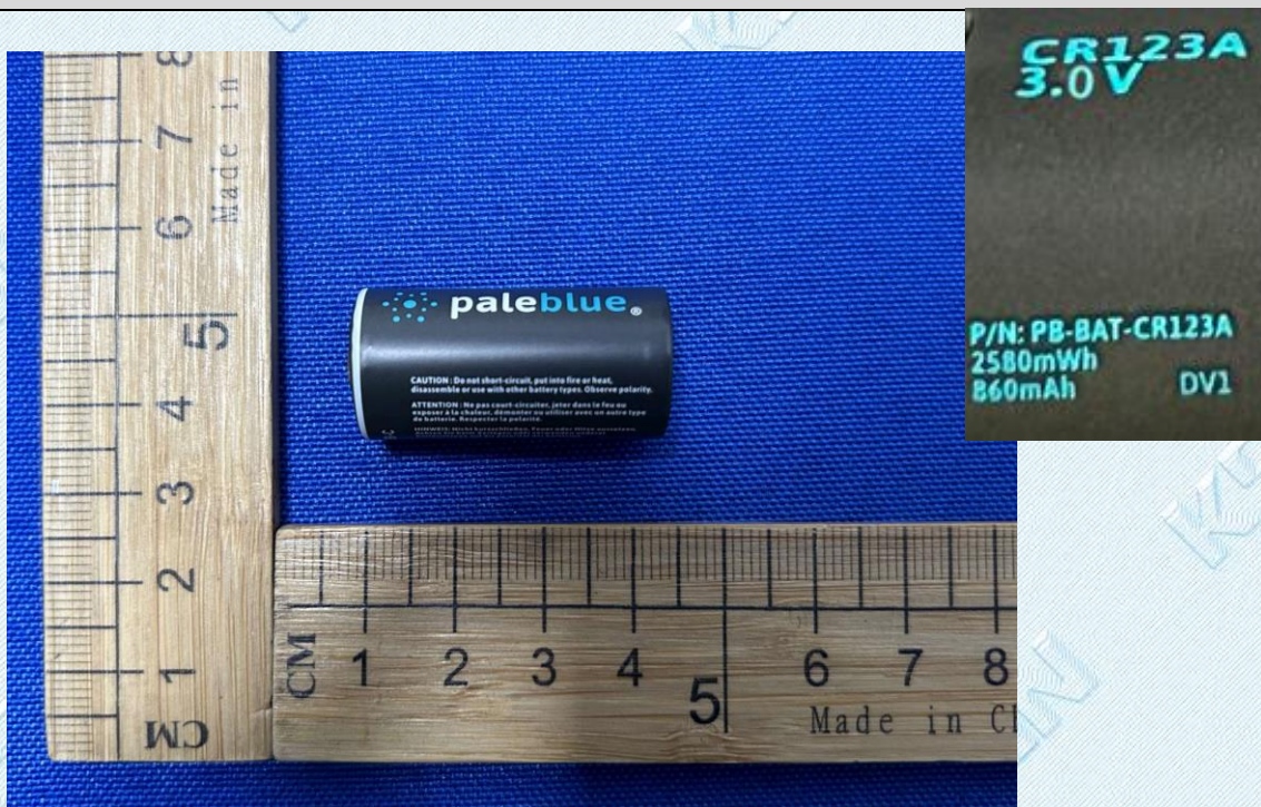
Figure 1 Front view of battery