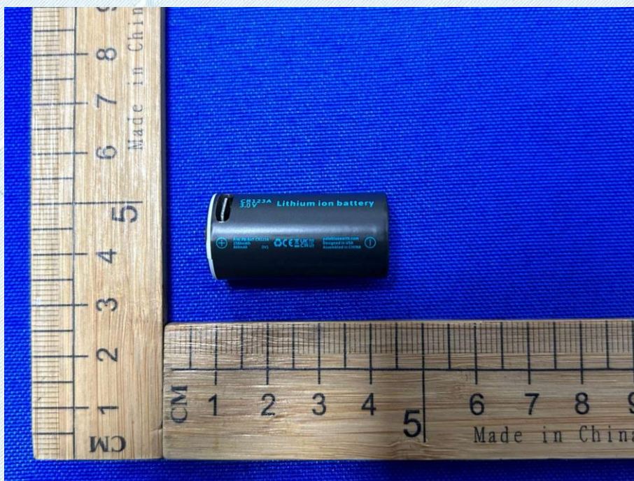
Figure 2 Back view of battery