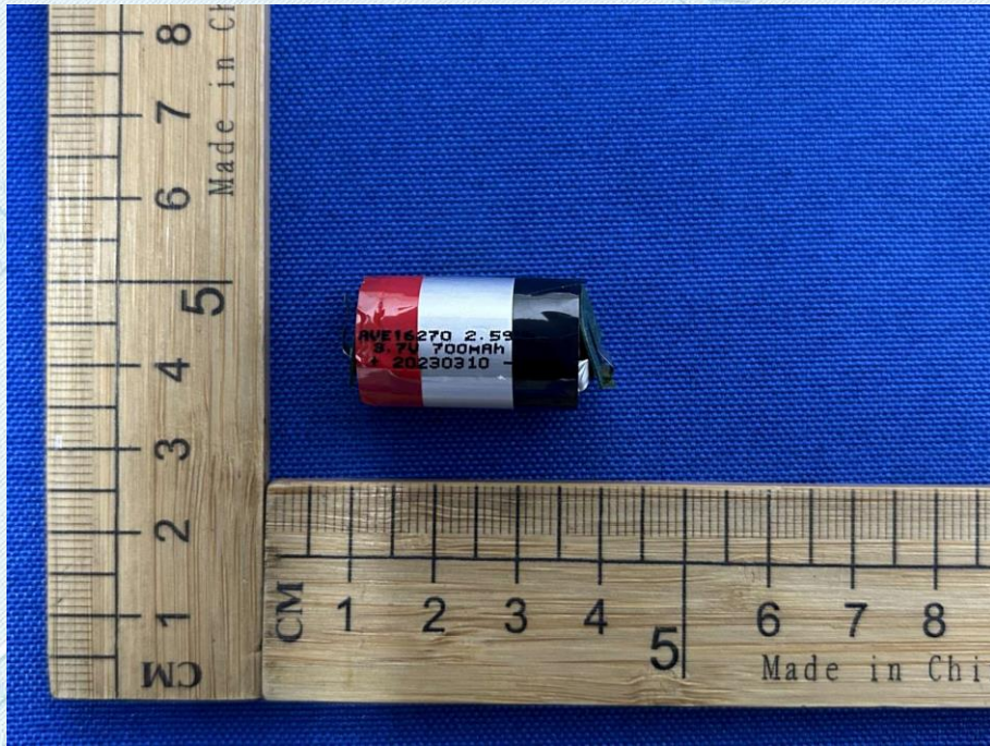
Figure 3 Front view of cell